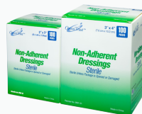
Sterile Non-Adherent Dressings