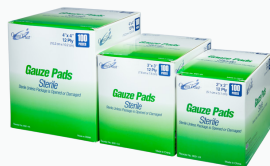
Sterile Gauze Pads

The introduction of Omni International's wound care products means optimal patient care with the consistent quality you have come to expect in our glove lines. Our wound care line includes a wide selection of high-quality gauze, non-woven, and adhesive bandage products designed for the healthcare professional.