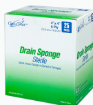
Sterile Drain Sponge