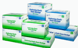
Conforming Gauze Elastic Bandages (sterile/non-sterile)