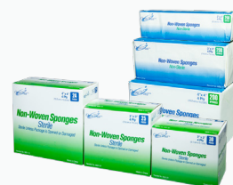
Non-Woven Sponges (sterile/non-sterile)