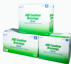
Sterile ABD Combined Dressing