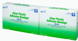
Sterile Clear Adhesive Bandages