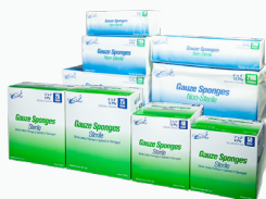
Gauze Sponges (sterile/non-sterile)