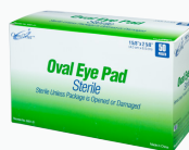
Sterile Eye Pads